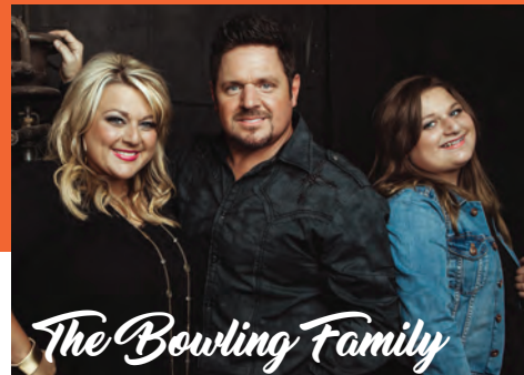
The Bowling Family